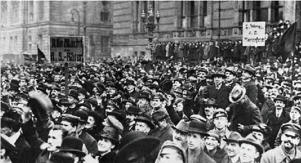
German Revolution 1918

ties, the obstacles which the enemy or the situation itself raise against its struggle. “Proletarian revolutions ... constantly criticise themselves, constantly interrupt themselves in their own course, return to the apparently accomplished, in order to begin anew; they deride with merciless thoroughness the half-measures, weaknesses, and paltriness of their first attempts, seem to throw down their opponents only so the latter may draw new