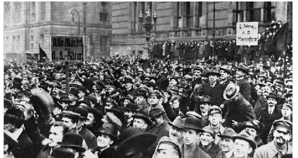
German Revolution 1918

ties, the obstacles which the enemy or the situation itself raise against its struggle. "Proletarian revolutions ... constantly criticise themselves, constantly interrupt themselves in their own course, return to the apparently accomplished, in order to begin anew; they deride with merciless thoroughness the half-measures, weaknesses, and paltriness of their first attempts, seem to throw down their opponents only so the latter may draw new