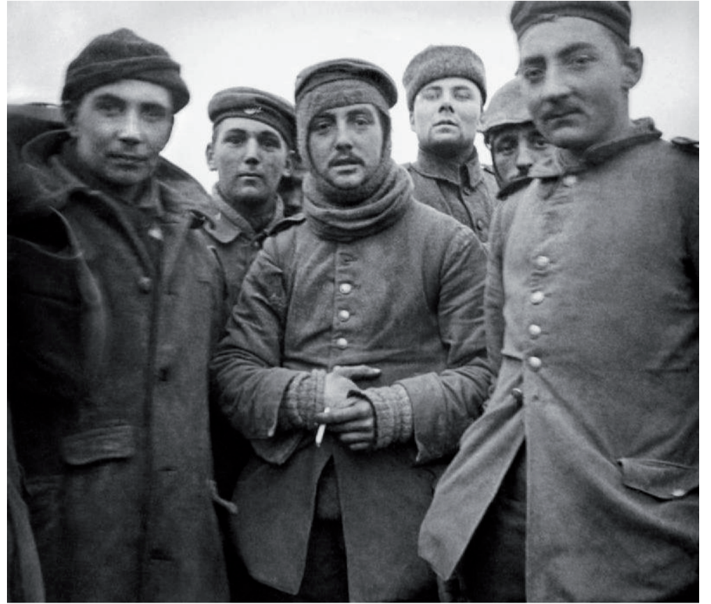
German and British troops fraternise on the western front in 1914

The nation states plunge into an arms race and hurl themselves at each others’ throats in the First World War. In a world wide slaughter, the productive forces chained in by historically obsolete relations of production are transformed into a destructive force of enormous power. With capitalism’s entry into decadence, warfare becomes a matter of equipment, and subjects the best part of production to military needs. The blind machine of