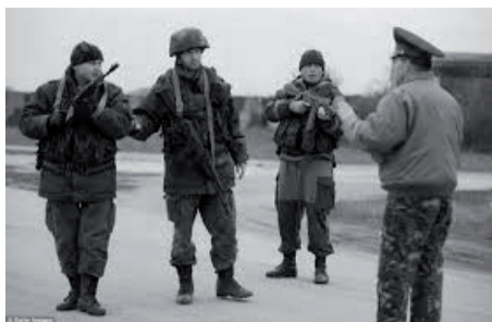
Russian and Ukrainian troops confront each other

an escalation of conflict to protect its economic interests. British capitalism also is very keen to protect Russian investment in the City and keep its concern over Ukraine at a rhetorical level.