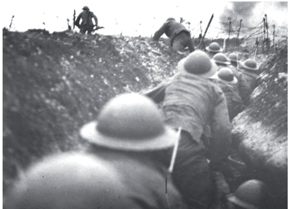
Recruitment of workers to fight in the trenches was a complete betrayal

The major role given to the Labour Party was not direct recruitment for the army but the containment of the working class by acting as its champion. One of the main vehicles for this in the first years of the war was the War Emergency National Workers' Committee (WENWC) which was formed in the first few days of the war (arising in fact from a meeting originally called to organise opposition to the war). It included trade