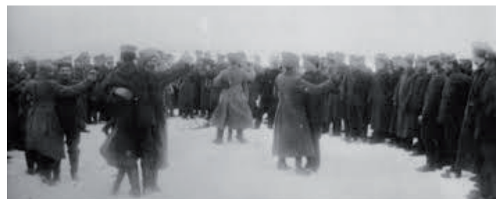
Russian and German troops fraternise on the eastern front in World War 1

In the sweep of history, it is only a short step from moral indignation to the politicisation of an entire generation. A new leap forward in the history of human culture is both possible and vital. This is what living historical experience tells us. ICC