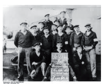
The sailor's mutiny in northern Germany in 1918 sparked the German revolution and helped end the war

One hundred years since 1914: Right and left justify imperialist war