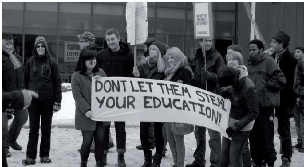
Student protesters in UK

The TUC and the Labour Party, as well as the numerous 'left wing' groups who act as their scouts, are there to keep protest and rebellion in-