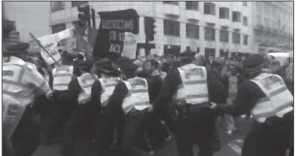
Electricians Strikes in Britain

the union would need to be involved, although this is seen in terms of getting them to join the union. And there has been a significant effort to seek solidarity of workers in other industries expressed in the strikes and demonstrations on 9th November to coincide with the student protest and the proposal to do the same on 30th alongside the public sector workers. At Farringdon on 16th November, although the numbers outside were smaller, some workers – including a group of Polish workers – refused to go in;